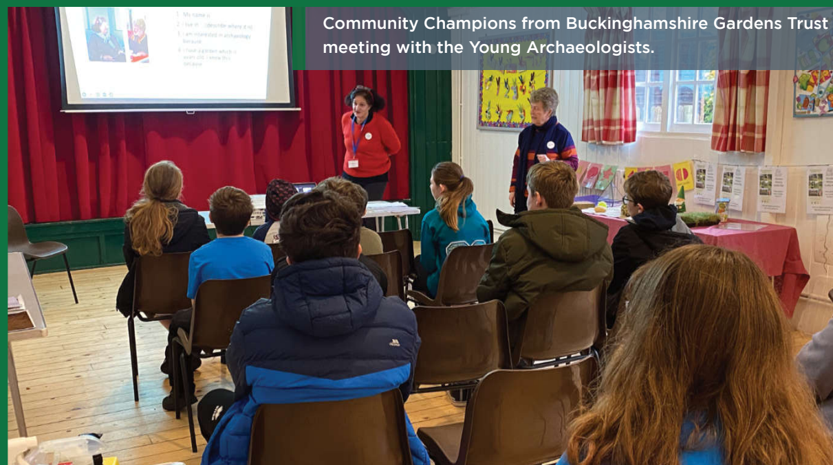
Community Champions from Buckinghamshire Gardens Trust meeting with the Young Archaeologists.

thegardenstrust.org/volunteer-as-a-gt-community-champion/